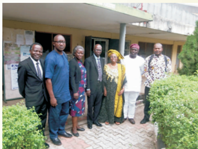
NSPP executives pay a courtesy visit to the Dean