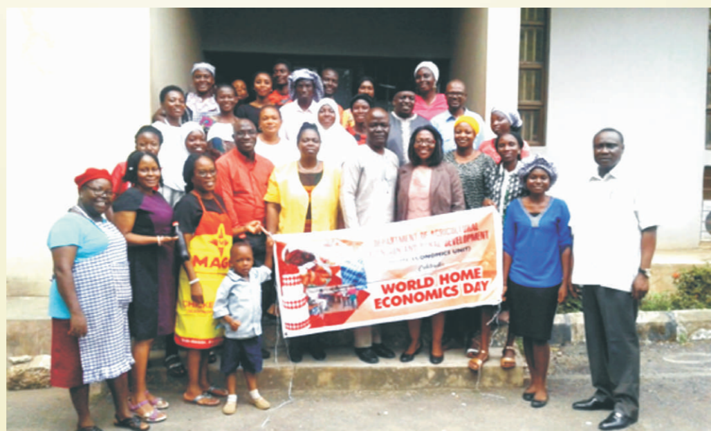
Group photographs of the participants