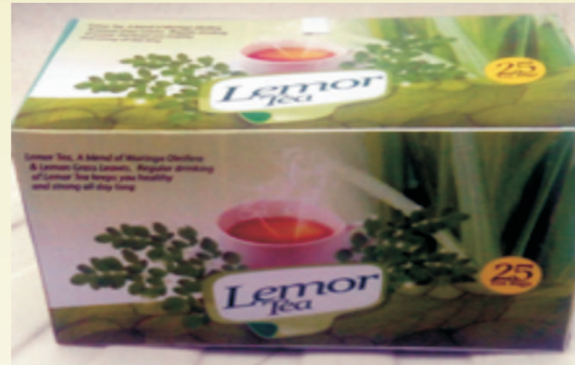
Sample of the final product; Lemor Tea