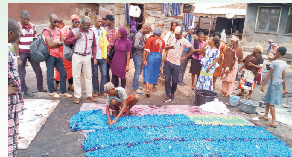
Local designer demonstrating how the Tinko tye and dye is made

The trip was aimed at exposing the international students to step-by-step process of producing different batik and Tye-dye designs such as Salad, Shengen, Adire Eleko, etc.