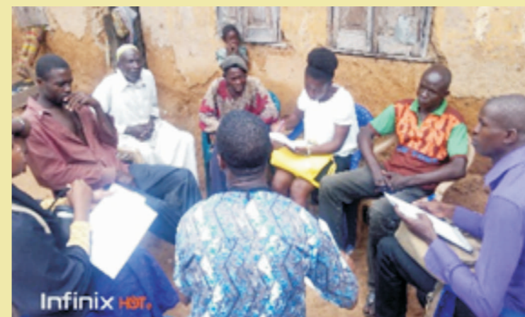
Questionnaire administration session by students