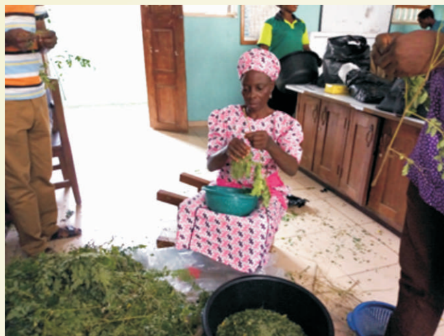
Rural instructor plucking the Moringa leaves

The Faculty of Agriculture, Department of Agricultural Extension University of Ibadan hosted 25 women from Ijaye Orile community for an empowerment programme. The programme had in attendance HOD of AERD, staff and students. The Moringa and Lemon grass leaves used were sourced locally from Ijaye Community.