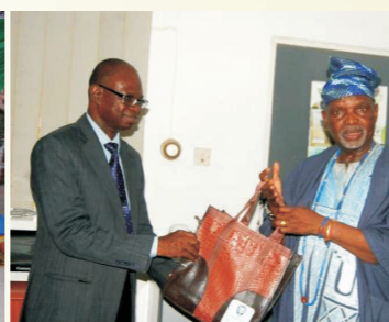
The Dean receiving the guests in his office