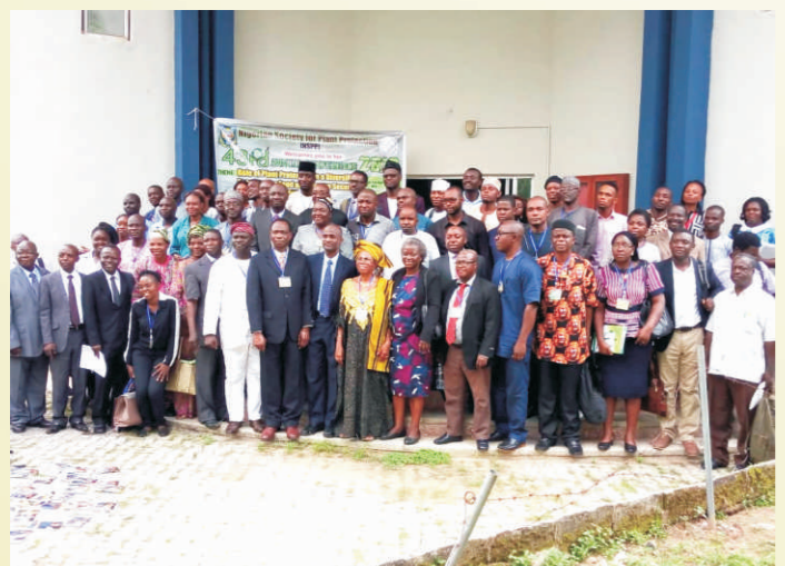
Some Participants at the conference