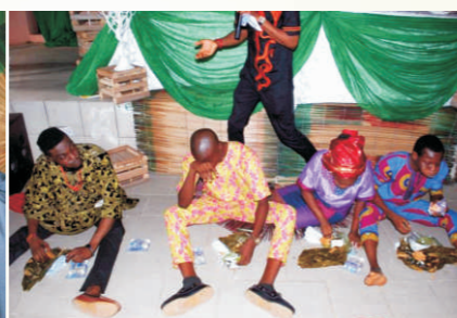
Fun time, students having an eating competition