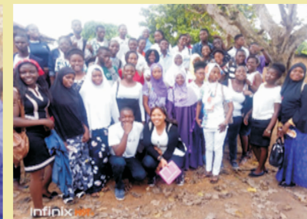
Group photograph of the AERD students